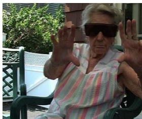
© Susan MacWilliam, Eileen , 2008 video still, synchronised triple channel installation (color, sound)