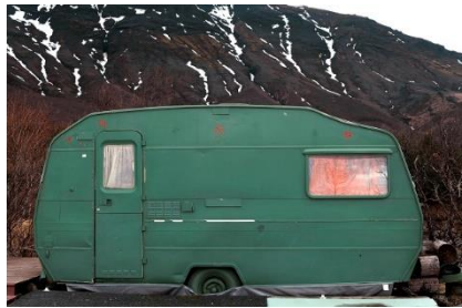
© Katrín Elvarsdóttir, Vanished Summer 17 , 2012 from the series Vanished Summer archival pigment print, 55 x 75 cm