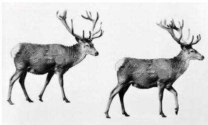
© Gabriele Rothemann, Doppelhirsch , 1997 photograph on baryte paper 110,5 x 238,5 cm