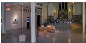
© Susan MacWilliam, exhibition view Modern Experiments , Highlanes Gallery, Drogheda, 2017