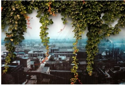
© Katrín Elvarsdóttir, Double Happiness 11 , 2013 from the series Double Happiness archival pigment print, 55 x 75 cm