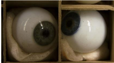
© Susan MacWilliam, Aldous's Eyes , 2014 video still (color, no sound) Courtesy of CONNERSMITH