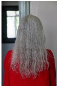
© Katrín Elvarsdóttir, Woman in Red Coat , 2008 from the series Equivocal archival pigment print, 85 x 57 cm