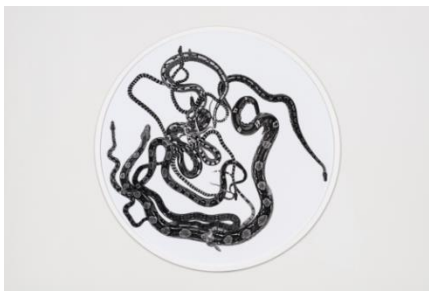
© Gabriele Rothemann, Schlangenmosaik I , 2012 photograph on baryte paper, ø 131,5 cm

Images may only be used in connection with the exhibition EIKON Award (45+) and by indicating copyrights!