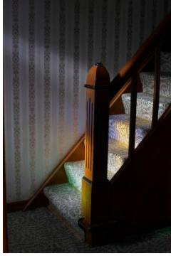
© Katrín Elvarsdóttir, Vanished Summer 6 , 2012 from the series Vanished Summer archival pigment print, 55 x 75 cm