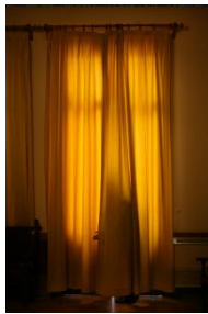
© Katrín Elvarsdóttir, Yellow Curtain 3 , 2009 from the series Equivocal archival pigment print, 85 x 57 cm