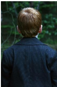
© Katrín Elvarsdóttir, Boy in Woods , 2008 from the series Equivocal archival pigment print, 85 x 57 cm