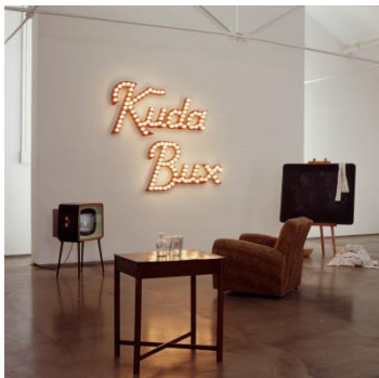
© Susan MacWilliam, installation view, Kuda Bux , 2003, Ormeau Baths Gallery, Belfast, 2003; installation with video (b/w, color, sound): 10'40" Courtesy of CONNERSMITH