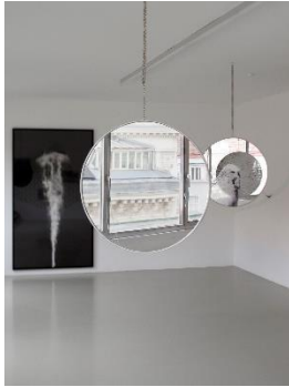
© Gabriele Rothemann, Wellensittichspiegel , 2016 digital print on mirror, each ø 71cm