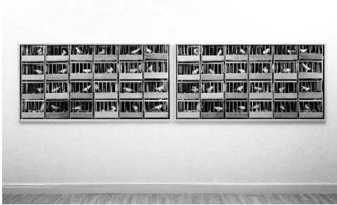
© Gabriele Rothemann, Vogelkäfige , 2005 photographs on baryte paper (diptych), each 94,5 x 185 cm