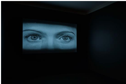
© Susan MacWilliam, installation view, KATHLEEN , 2014, video in loop (b/w, sound): 33' Courtesy of CONNERSMITH